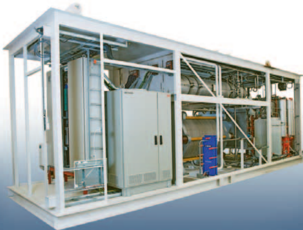
The High Pressure Electrolyser (HPE) series electrolyzers are compact, durable and the best choice where volumes of hydrogen generation in ranges from 10 Nm 3 /h to 65 Nm 3 /h are required. Illustrated: 60 Nm 3 /h HPE unit.

The supply of complete systems usually enables us to conduct full functional tests of the equipment at maximum load before delivery. This pre-testing, together with optional container housing reduces on-site installation and start-up costs to a minimum.