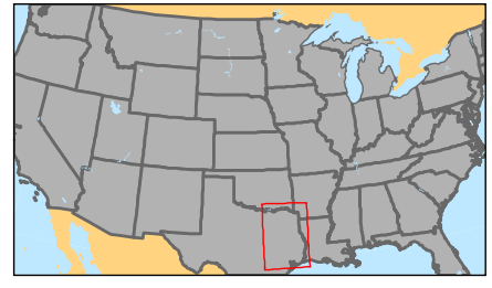
Figure 3.10.1-12 Environmental Justice Analysis - HPSA and MUA/P Designations (Texas)