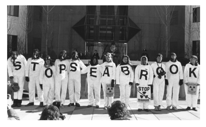
Opponents of a full-power license for Seabrook express their views at NRC headquarters in Rockville, Maryland, 1990

and Massachusetts sought to do in the cases of Shoreham and Seabrook. In New York, Governor Mario M. Cuomo and other state officials claimed that it would be impossible to evacuate Long Island if Shoreham suffered a major accident. Although plant proponents pointed out that emergency plans did not require the evacuation of all of Long Island if a serious accident occurred, the State refused to join in emergency planning procedures or drills. The NRC granted Shoreham a low-power operating license, but the State and the utility, Long Island Lighting Company, eventually reached a settlement in which the company agreed not to operate the plant in return for concessions from the State.