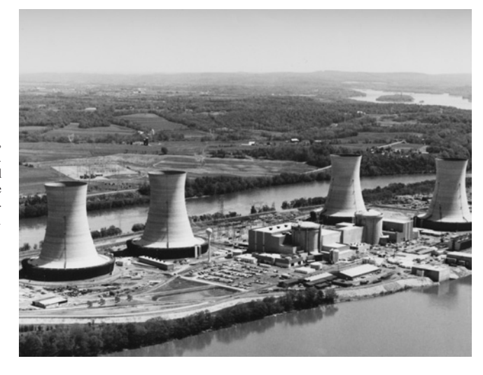
Three Mile Island, looking southeast. The accident occurred in the reactor at the right of the photograph.

to work according to design, the operating crew decided to reduce the flow from them to a trickle. By the time that experts realized that the plant had undergone a loss-of-coolant accident and flooded the core, the reactor had suffered irreparable damage.