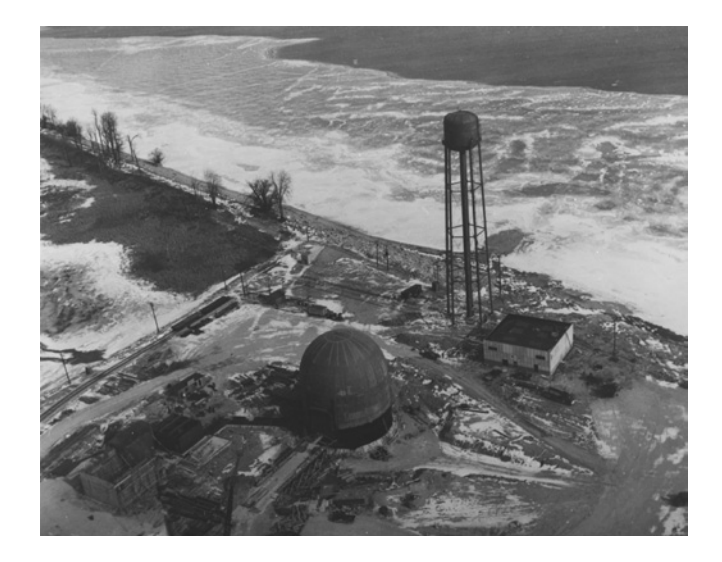
PRDC reactor under construction, 1958.

fast breeder reactor, despite the reservations of ACRS, ignited an acrimonious controversy with the Joint Committee and raised questions about the AEC's regulatory program. In January 1956, the Power Reactor Development Company (PRDC), a consortium of utilities led by Detroit Edison Company, applied for a permit to build a fast breeder reactor in Lagoona Beach, MI, located on Lake Erie within 30 miles of both Detroit, MI, and Toledo, OH. The AEC had already received applications for two privately financed reactors, but the PRDC proposal was the first to come in under the power demonstration program.