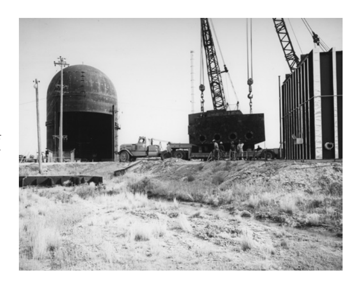
LOFT reactor under construction, 1969.

building. The intensely radioactive fuel would then continue on its downward path into the ground. This scenario became known as the "China syndrome," because the melted core would presumably head through the Earth toward China. Other possible dangers of a core meltdown were that the molten fuel would breach containment either by reacting with water to cause a steam explosion or by releasing elements that could then combine to cause a chemical explosion. The precise effects of a large core meltdown were uncertain, but it was clear that the effects of radioactivity spewing into the atmosphere could be disastrous. ACRS and the regulatory staff regarded the chances of such an accident as low; they believed that it would occur only if the emergency core cooling system (ECCS), made up of redundant equipment that would rapidly feed water into the core, failed to function properly. However, they acknowledged the possibility that the ECCS might not work as designed. Without containment as a fail-safe final line of defense against any conceivable accident, they sought other means to provide safeguards against the China syndrome.