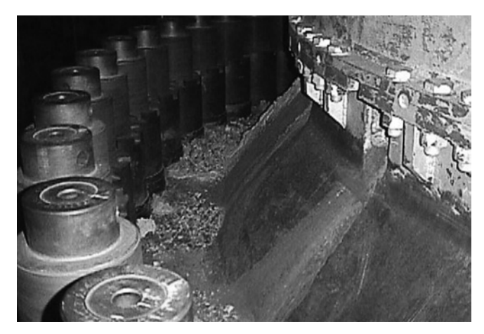
The discovery of extensive corrosion on Davis-Besse's reactor vessel head led to an extensive shutdown for the plant's utility company and considerable reform of NRC inspection practices.

response to the discovery of "circumferential cracking" at two pressurized-water reactors, a defect that could over time cause a serious accident. The inspections would have to be performed when plants were shut down for refueling or other reasons, and the NRC specified that the date for conducting the surveys could be moved back if the staff judged on a case-by-case basis that the risks were acceptably small. First Energy petitioned the NRC to postpone the Davis-Besse inspection until a scheduled outage on March 31, 2002. The NRC staff reviewed the request and determined that the utility could run the plant until February 16, 2002, without triggering a "significant safety concern."