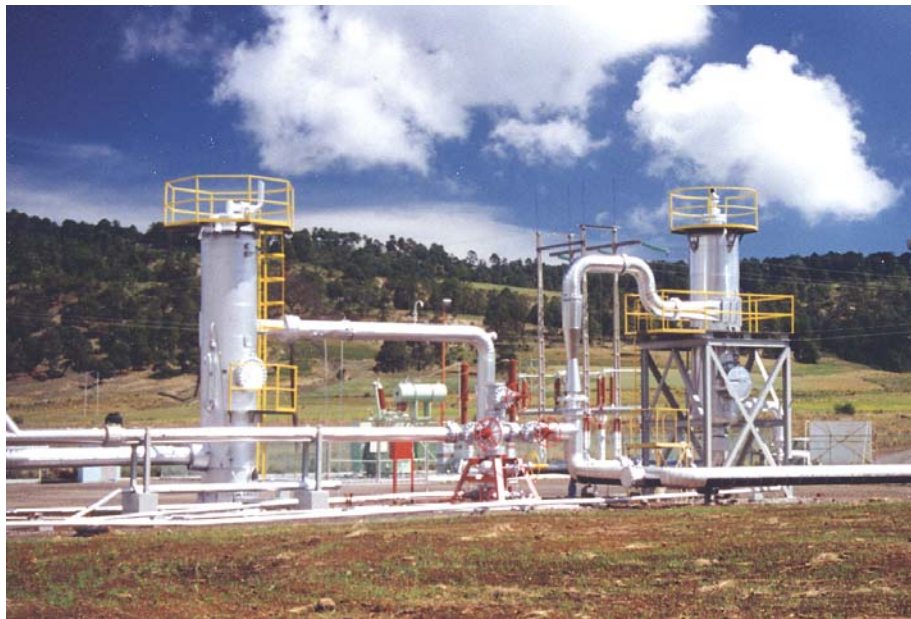
Los Humeros Geothermal Field.

The heat source for Los Humeros is the magma chamber that created the caldera. Some studies indicate that the chamber ap-