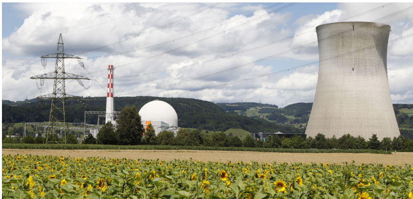
Leibstadt nuclear power plant, 9 July 2012.

The decision to phase out nuclear energy is of strategic importance for Switzerland. Providing a clean, economic, and climate-friendly supply of energy is a major political and societal challenge. A number of ongoing developments in Europe pose further obstacles to a transformation of Switzerland's energy supply. If the Federal Council's "Energy Strategy 2050" is to be implemented successfully, a consensus on burden-sharing must be reached.