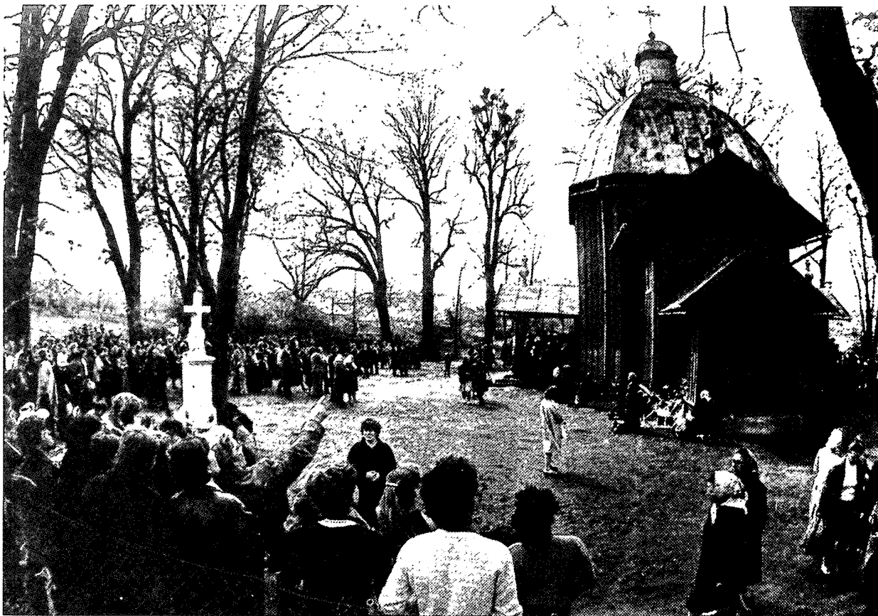
Figure 6. "Miracle in Grushevo"—the Western Ukrainian village in L'vov Oblast where a young girl reportedly saw a vision of the Virgin Mary on the first anniversary of the Chernobyl' accident. In August 1987, Literaturnaya gazeta reported daily crowds of 40,000 to 45,000 persons converged on the site. [redacted]