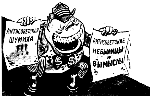
Figure 4. The May 1986 issue of the Soviet journal Ogonyok carried this caricature of the West under the caption "Irradiation by Lies." The teeth spell out "gloating over other's misfortune"; the signs read "anti-Soviet agitation," and "anti-Soviet falsehoods and fabrications." [redacted]

to Western observers the compassionate, humane face of the Soviet Government during a tragic accident and to promote himself as a peacemaker. A recurrent theme has been that the accident demonstrates the need for removal of the nuclear weapons from Europe, where a conflict could unleash the radiation equivalent of dozens of Chernobyl's. He also used the occasion to announce an extension of the Soviet nuclear test moratorium. [redacted]