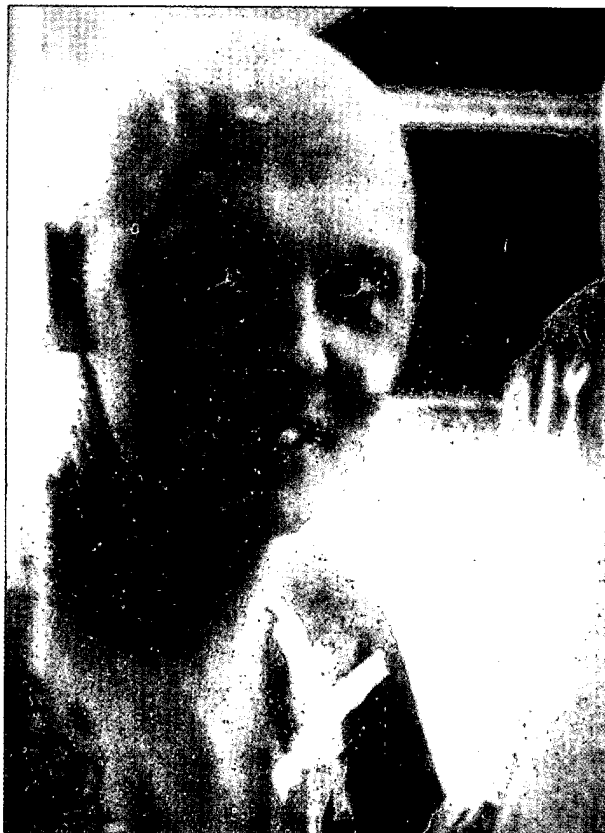
Figure 5. Radiation burns on a Chernobyl' fireman, one of the 500,000 persons now being monitored for long-term effects of radiation. [redacted]

loss of health professionals to permanent relocation has created shortages in this sector in the Ukraine and Belorussia, according to the Kiev Oblast officials.