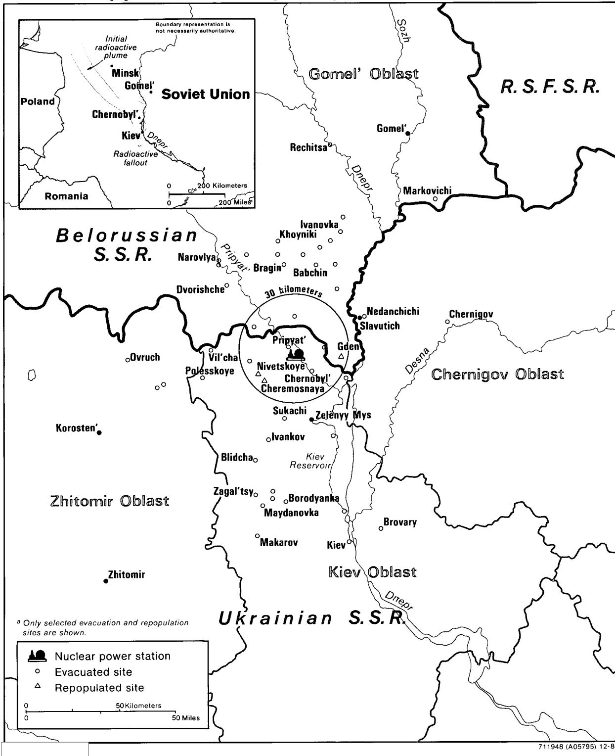
Figure 1 Evacuated and Repopulated Sites Surrounding Chernobyl a