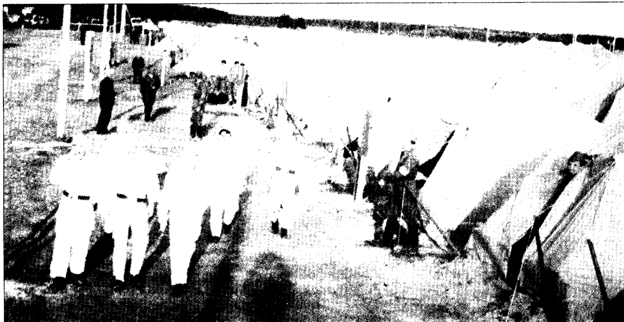
b) A June 1986 photo of a military field camp for chemical troops working inside the contaminated zone.