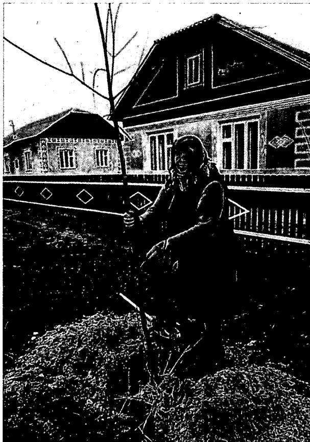
Figure 7. Thousands of evacuees were resettled in or near Kiev, many in hastily built settlements like the one depicted behind a displaced Chernobyl' woman.

The sudden loss of hundreds of thousands of people from the affected area is already having repercussions in social services and the agricultural labor force. Kiev Oblast party boss Revenko last December said the area faces serious shortages of specialists for state farms, schools, stores, and hospitals because most of the people who left the area after the accident have not returned and may never return. In addition, people are apparently reluctant to work in the contaminated zone where Chernobyl' nuclear plant units 1, 2, and 3 are now in operation. The new director of the plant and other experts expressed concern about shortages of workers—now at about half the preaccident strength.