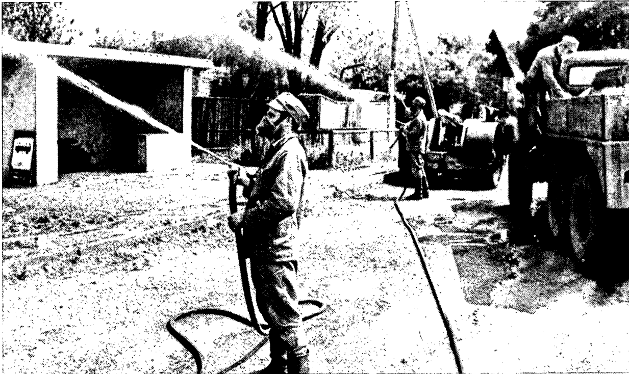
Figure 2. a) Military reservists decontaminating one of the villages in Chernobyl' Rayon inside the 30-kilometer zone in August 1986.