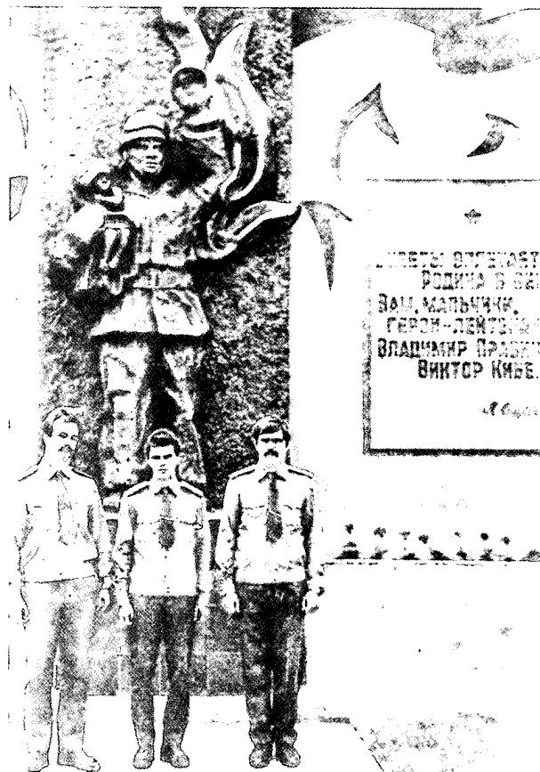
Figure 3. Chernobyl' Victims as Heroes: The Soviet press consciously exploited the Chernobyl' disaster to marshal citizen support for regime policies. It was full of stories of sacrifice and heroism of workers engaged in the cleanup of Chernobyl', comparing their work with the heroic deeds of World War II soldiers. Those who died in the accident were given heroes' funerals and were posthumously awarded the title of "Hero of the Soviet Union." This photo, which appeared in Pravda Ukrainy on 4 July 1986, depicts a monument erected at the Cherkassy Technical School for firemen in the Ukraine where some of the firemen who died were trained. [redacted]

Gorbachev himself remained silent until 14 May, almost three weeks after the accident. By lowering his own profile and allowing others to take the heat, he probably hoped to be associated with recovery rather than disaster and thus avoid blame. When he at last spoke on 14 May, he used the opportunity to present