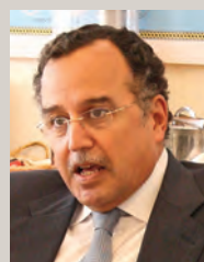
Nabil Fahmy American University in Cairo