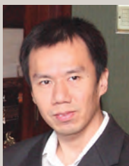
Alvin Chew Gulf Research Center; Centre for Non-Traditional Security Studies